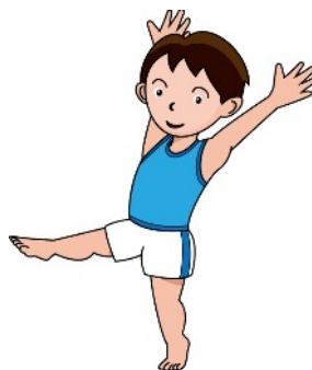
Gymnastics with an annual Key Steps competition